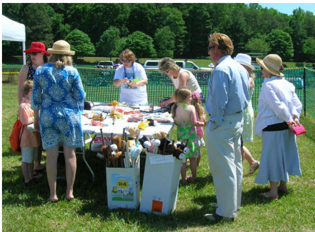
Stick Horse Registration