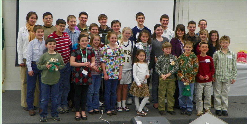
Achievement Award Winners