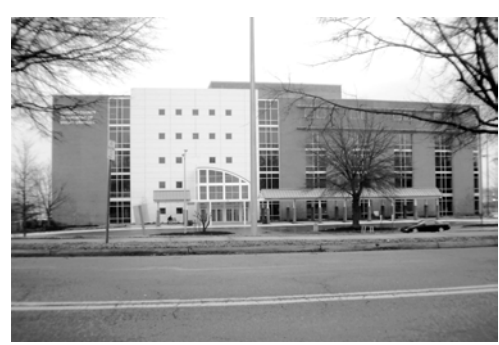
741 North Highland Avenue

In April, 2004, the Department completed the move from five locations to a newly renovated building located at North 741 Highland Avenue. The location formerly served as the Reynolds Health Center and is conveniently located between the Department of Public Health and HopeRidge (formerly CenterPoint Human Services).