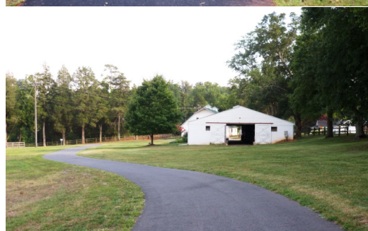
The multi-use trail goes next to the stables and through the woods

If you want to get extra exercise, consider riding your bike from home to the trail for a walk or extended ride. Using a bicycle for transportation not only burns calories - it helps the environment.