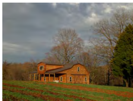
A beautiful farm and barn

The amount of land cultivated at Harmony Ridge has "grown" in the past three years — from 1 1/2 acres in 2010, to 3 acres in 2011, to almost 7 acres in 2012. Everything at Harmony Ridge is grown from seed and has been raised organically since the farm's inception.