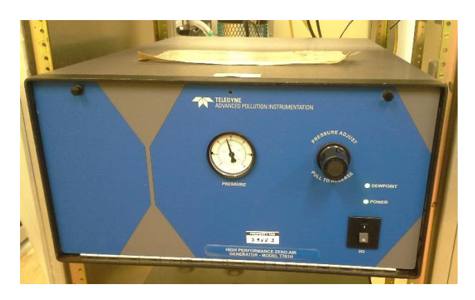
Fig. 1: Front panel of the T701H Zero Air Generator.

13.2.5 The instrument is producing zero air and ready to use when the pressure is steady at 30 psi and the dew point sensor LED is illuminated green.