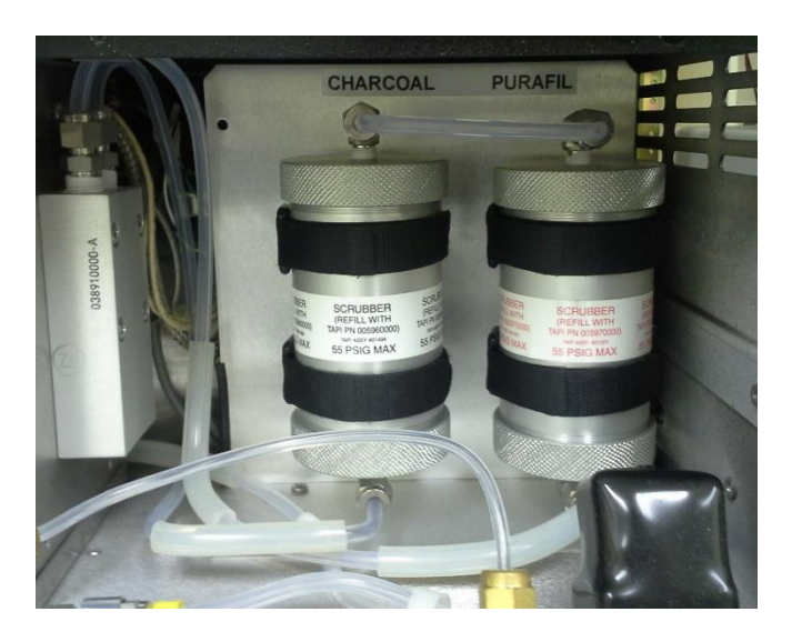
Fig. 2: Columns filled with charcoal and purafil inside the T701H.

13.3.4 The charcoal and purafil columns (see Fig. 2) should be replenished. Refer to Operation Manual, Models T701, T701H, 701 and 701H Zero Air Generators, (Oct 2014) Chapter 6.4 and 6.5.