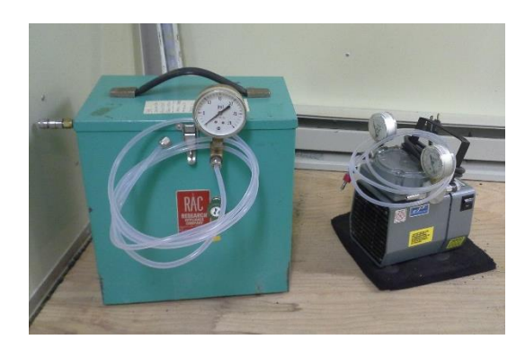
Fig. 4: Two part Audit Zero Air supply set up.

The primary zero air generators used for audits contain a mobile set up of two parts: a pump and a drier/purifier box.