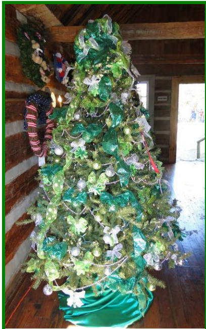
2 nd Trailblazer Teens 4-H Club