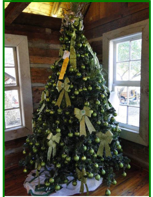
5 th P.E.A.C.E. Team