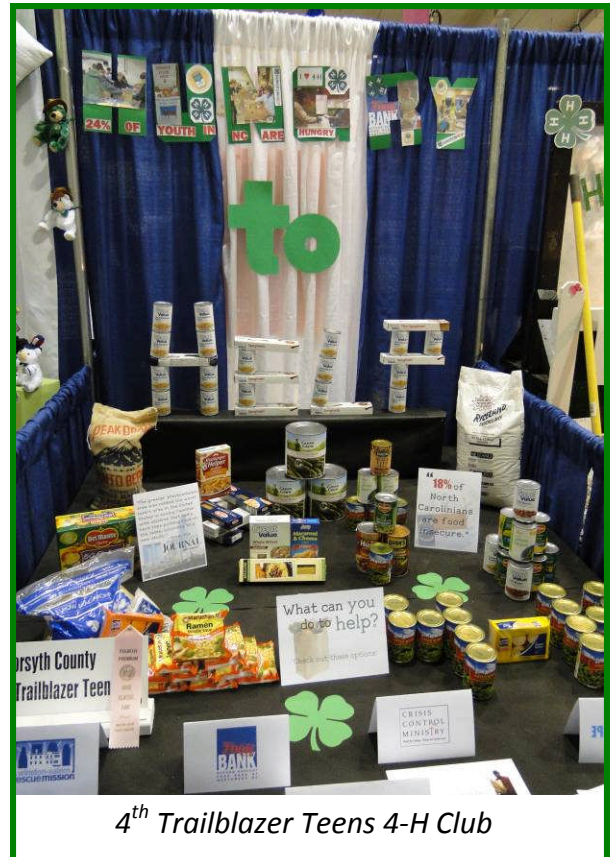
4 th Trailblazer Teens 4-H Club