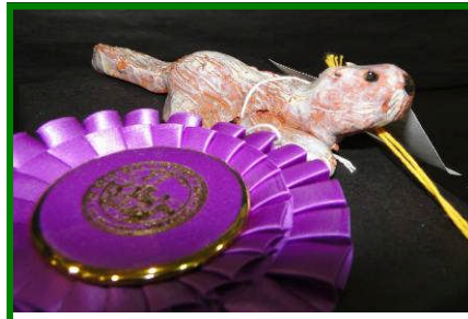
Luke Arrowood - sculpture