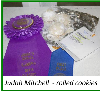
Judah Mitchell - rolled cookies