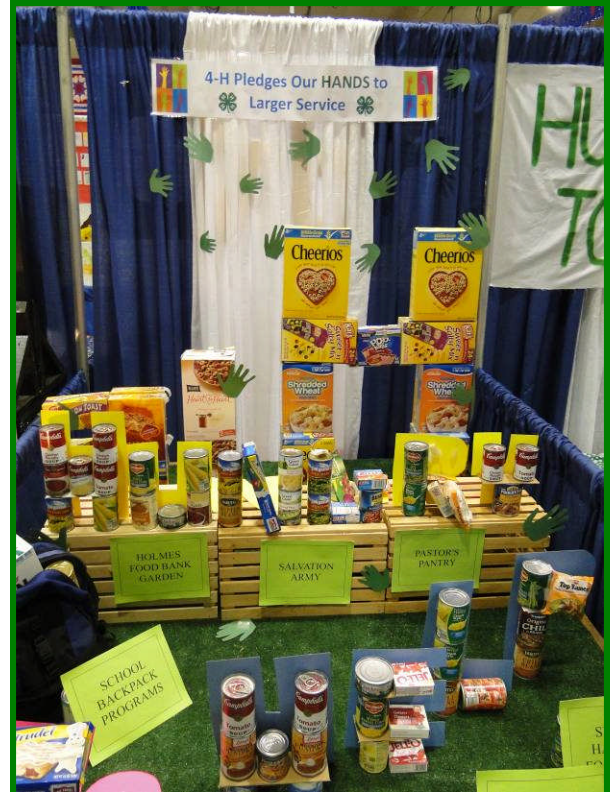
2 nd Trailblazers 4-H Club