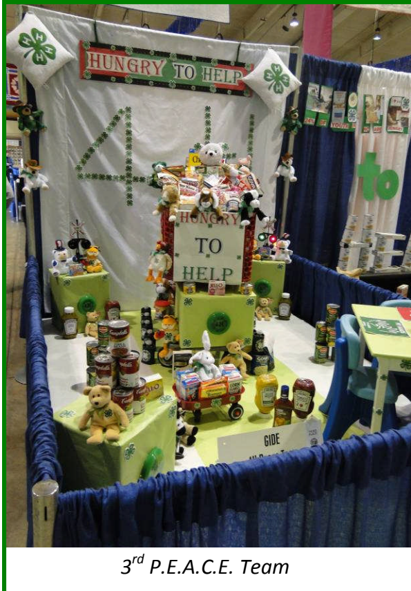
3 rd P.E.A.C.E. Team