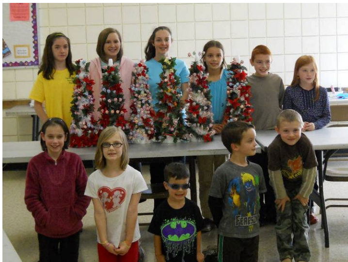
The Wascally Wabbits 4-H Club recently made Christmas trees for the Samaritan Soup Kitchen Christmas dinner.