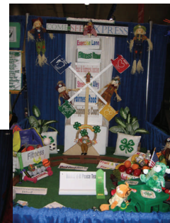
P.E.A.C.E. Team 6th Place Booth