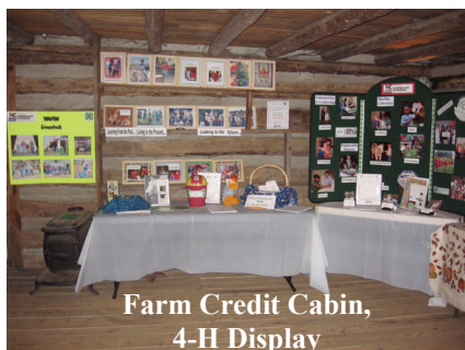
Farm Credit Cabin, 4-H Display

“A New Frontier for Fun” is correct, because fun is what was had by all. Forsyth County 4-H had the opportunity to set up a display this year in the Farm Credit Cabin in the Village of Yesteryear. We had a quiz for this year’s fairgoers to complete in order to win some great 4-H prizes. We appreciate all of the participation we received in our contest! It’s neat to see how far people come just to go to the fair! Some of our 4-H’ers participated in various contests during the fair this year, and our clubs did some outstanding booth designs! See below for a list of winners this year.