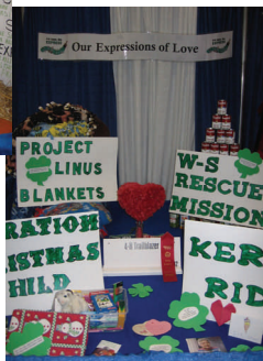
Trailblazers 2nd Place Booth