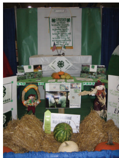
Carter Vocational 7th Place Booth